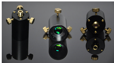
Connector of SMA 905